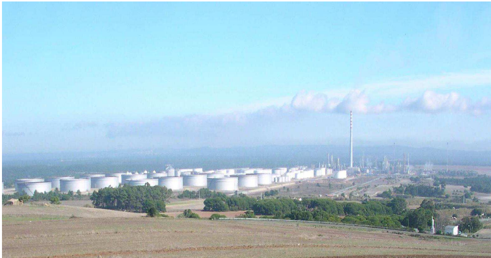
FIG. 2 – General View of Sines Refinery

Sines refinery is constituted by a number of processing units spread across two plants, known as Manufacturing I and Manufacturing II. It has a large storage area with a capacity of approximately 3 million cubic metres for crude oil, fuels and other final products and intermediate products.